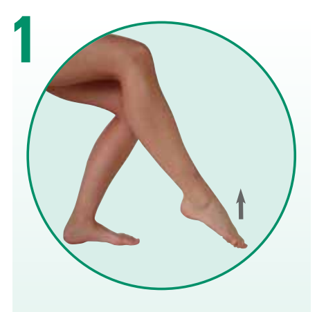
While sitting, lift one foot off the floor and alternate flexing and pointing your toes. Repeat with the other foot. (20x)