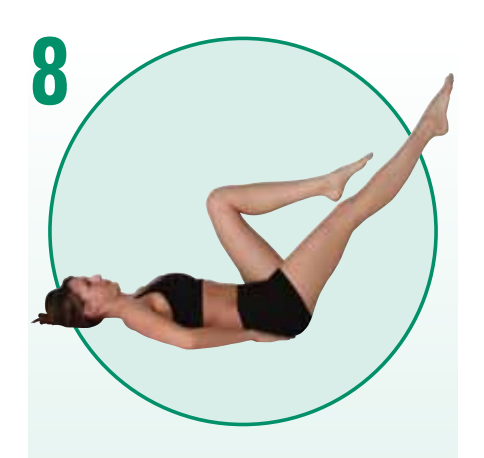
Lying on the floor, place hands near lower back for support. Cycle legs in the air using short circular motions for 30 seconds. Repeat this exercise as tolerated.