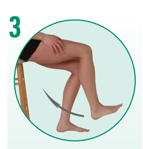
In a seated position, lift one foot off the floor and draw your heel back toward the buttocks. Hold and contract hamstring muscle, return foot to starting position. Repeat with the other leg. (10x)