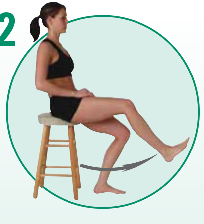
With both feet on the floor, extend one leg straight out in front of you, hold and contract your thigh muscle, then return foot to the floor. Repeat with the other leg. (10x)