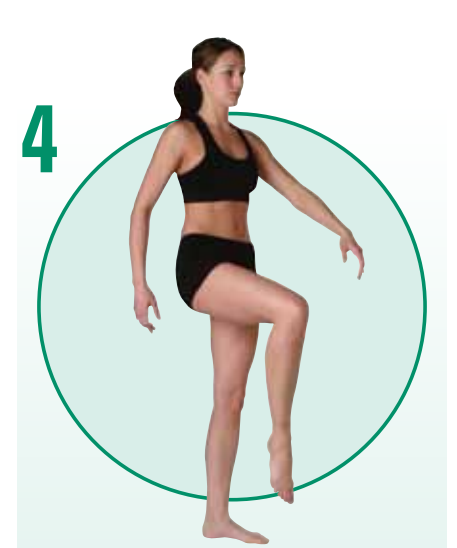
March in place while loosely swinging your arms, lifting your knees as high as possible. (20x)