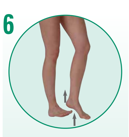
While bearing weight on the toes of one foot, bear weight on the heel of the other foot. Hold for one count and alternate feet. (20x)