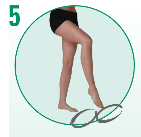
Lift one foot off the ground. With your toes pointed, form a figure eight pattern in the air. Repeat with the other leg. (10x)