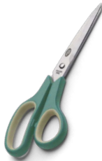
VetkinTape Soft Touching Scissors 8717624164088