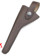
Leather Belt Set 8719172260571