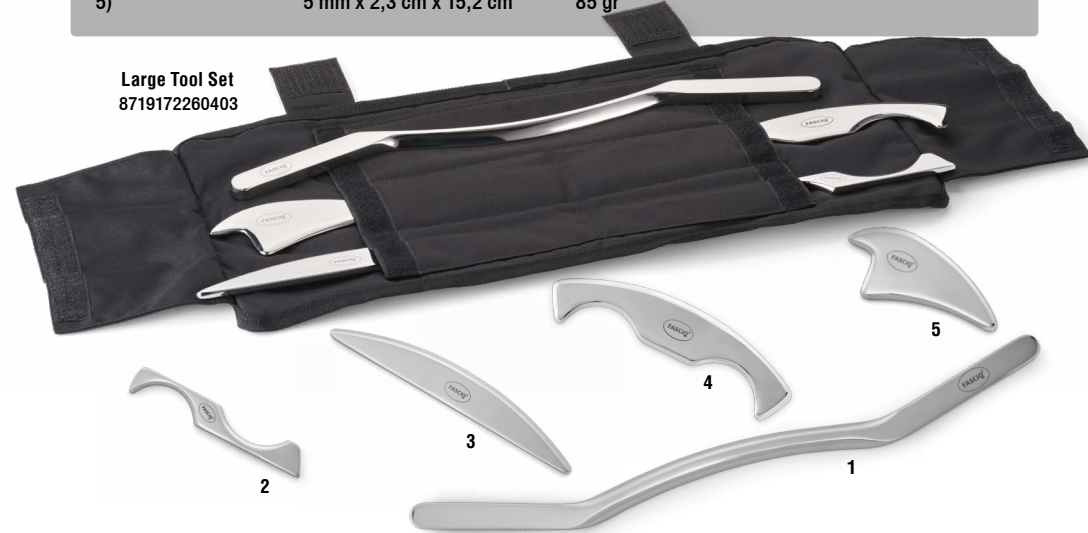
Large Tool Set 8719172260403