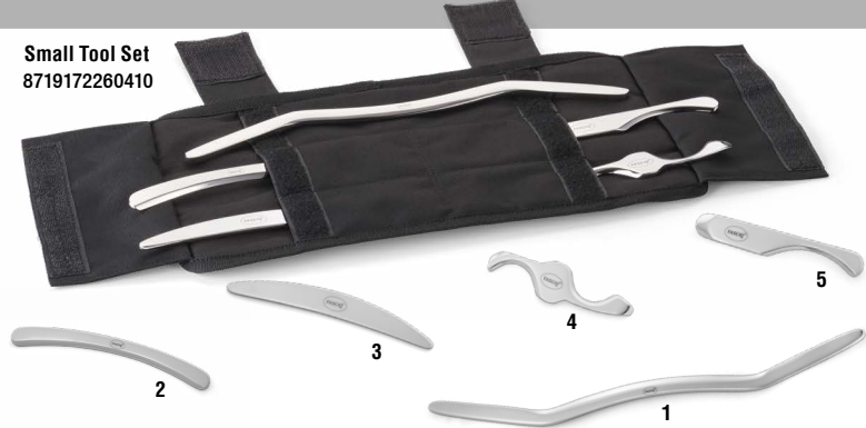
Small Tool Set 8719172260410