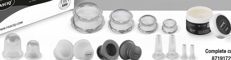
Complete cupping set 8719172261080

All cups are made of high-quality silicone with a special grip addition. As a result, the cups offer extra grip during application. Ideal in combination with the free fascia cream included in the package! The set is suitable for both daily practice and home use.