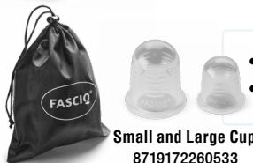
Small and Large Cup 8719172260533

Silicone Cupping Set of 4 different transparent Cellulite cups, packed in a convenient, FASCIQ® fabric storage bag. The diameters of these cuppings (cellulite cups) are 4.5 cm / 6 cm / 7.5 cm and 10 cm.