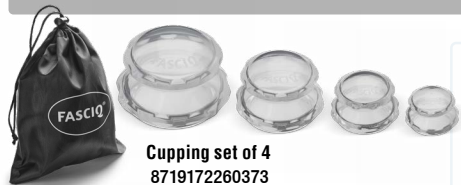
Cupping set of 4 8719172260373

The FASCIQ® silicone cupping sets (or silicone massage cups) are plastic silicone-based cups. 100% food grade silicone