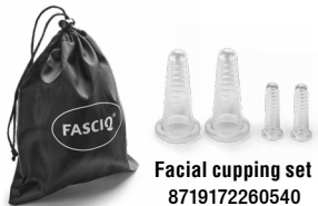
Facial cupping set 8719172260540

The Mini facial cups are suitable for the treatment of eye contours and wrinkles above the lips. The Medium facial cups are used for neck, décolleté and other areas of the face.