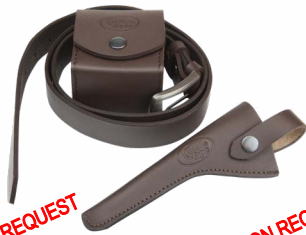
VetkinTape High-Quality Scissors 8719172260212