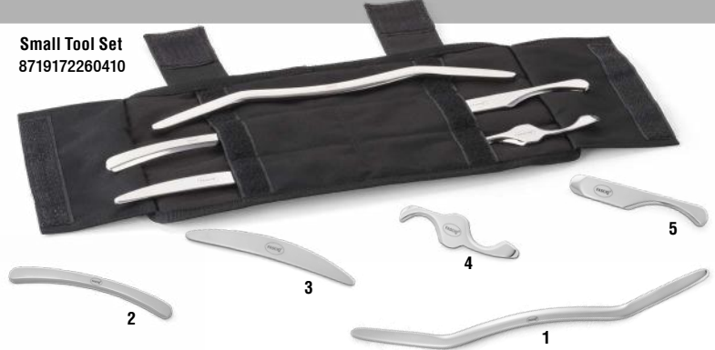
Small Tool Set 8719172260410