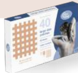
CrossLinq Single Pack Large (40 patches) 8717624163036