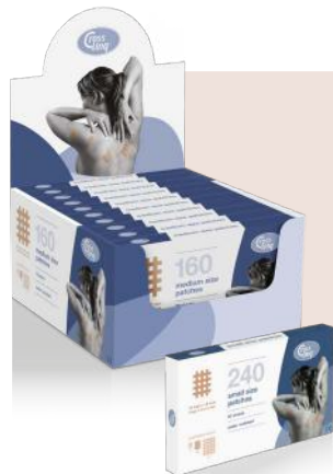
CrossLinq Single Pack Small (240 patches) 8717624163012

When applying to pain points you can easily apply the CrossLinq® yourself, however, application to trigger points and acupuncture points requires specific knowledge.