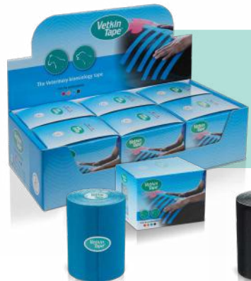
10cm Blue 8717624164521