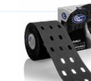
Punch Black 8717624160745