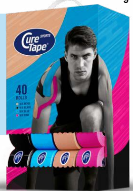
Big Boy Sports 8717624165788

Materials: Elastic viscose tape with a breathable, hypoallergenic acrylic layer with 25% more adhesive strength than the Classic range. Dimensions: Roll: 5 cm x 5 meters Displaybox: 40 rolls (10 rolls per colour) Available colours: