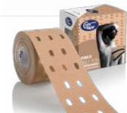
Punch Beige 8717624160622

Due to the unique hole pattern, this tape has a greater stretching capacity and the working direction is three-dimensional. The skin and fascia receive much more signals due to the pressure differences that arise around the hole pattern. The skin also has more opportunity to ventilate.