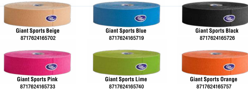
Giant Sports Beige 8717624165702 Giant Sports Blue 8717624165719 Giant Sports Black 8717624165726 Giant Sports Pink 8717624165733 Giant Sports Lime 8717624165740 Giant Sports Orange 8717624165757

The CureTape Giant is the largest roll in our range, measuring 5 cm x 31.5 m. CureTape Giant sports has the same composition as CureTape sports with an elastic, breathable, viscose tape tape with a hypoallergenic acrylic adhesive layer with 25% more adhesive power. Most tape applications have a bond time of 4 to 7 days.