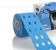
Punch Blue 8717624160653