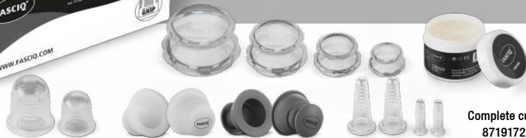
Complete cupping set 8719172261080

All cups are made of high-quality silicone with a special grip addition. As a result, the cups offer extra grip during application. Ideal in combination with the free fascia cream included in the package! The set is suitable for both daily practice and home use.