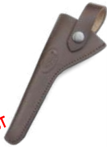
Leather Belt Set 8719172260571