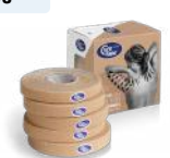
1 cm x 5 m Classic Beige 8717624160929