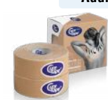
2.5 cm x 5 m Classic Beige 8717624160288