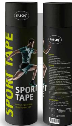
2.5 cm (12 rolls) 8719172261059