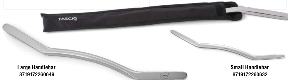
Large Handlebar 8719172260649

Weight 0.153 kg Dimensions 31 × 1 × 0.5 cm