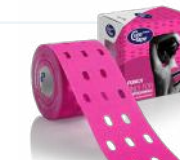
Punch Pink 8717624160684