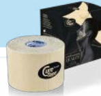
Beauty Beige 8717624165443

Materials: Elastic cotton with a breathable, hypoallergenic acrylic adhesive. Dimensions: Roll: 5 cm x 5 meters Displaybox: 6 rolls Available colours: