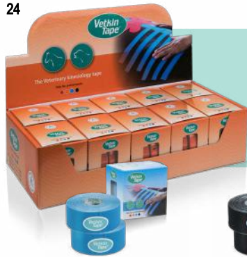
3 cm Blue 8717624165290