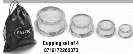
Cupping set of 4 8719172260373

The FASCIQ® silicone cupping sets (or silicone massage cups) are plastic silicone-based cups. 100% food grade silicone