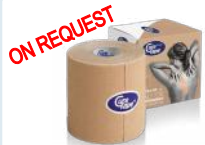
7.5 cm x 5 m Classic Beige 8717624160257