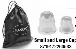
Small and Large Cup 8719172260533

Silicone Cupping Set of 4 different transparent Cellulite cups, packed in a convenient, FASCIQ® fabric storage bag. The diameters of these cuppings (cellulite cups) are 4.5 cm / 6 cm / 7.5 cm and 10 cm.