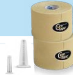
Beauty 2 Roll Beige 8717624165801

Materials: Elastic cotton with a breathable, hypoallergenic acrylic adhesive. Dimensions: Roll: 5 cm x 5 meters Displaybox: 2 rolls Available colours: