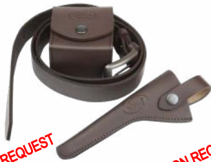
VetkinTape High-Quality Scissors 8719172260212