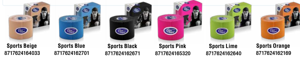
Sports Beige 8717624164033 Sports Blue 8717624162701 Sports Black 8717624162671 Sports Pink 8717624165320 Sports Lime 8717624162640 Sports Orange 8717624162169

CureTape Sports kinesio tape is an elastic tape made of viscose with 25% more adhesive strength. The perfect choice for sports-related complaints and injuries, but also for other applications where more adhesive strength is desired, such as tape applications on feet and hands. The sports variant is also often chosen for preventive use during sports. CureTape Sports, is made of viscose. Viscose is just as comfortable to wear as cotton, it has a smoother, more supple feel to it, it dries faster and is easy to apply.