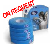
1 cm x 5 m Classic Blue 8717624160950