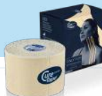
Gentle Beige 8717624165689

Materials: Elastic cotton with a breathable, hypoallergenic acrylic adhesive. Dimensions: Roll: 5 cm x 5 meters Displaybox: 6 rolls Available colours: