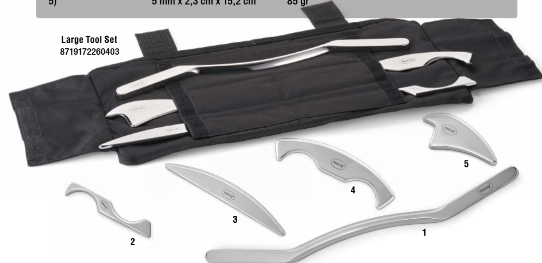
Large Tool Set 8719172260403