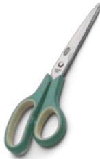
VetkinTape Soft Touching Scissors 8717624164088