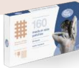
CrossLinq Single Pack Medium (160 patches) 8717624160998