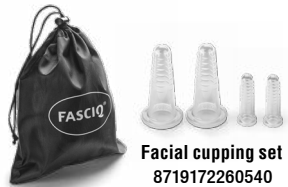
Facial cupping set 8719172260540

The Mini facial cups are suitable for the treatment of eye contours and wrinkles above the lips. The Medium facial cups are used for neck, décolleté and other areas of the face.