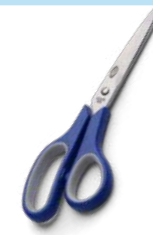
Soft Touching Scissors 8719172260717