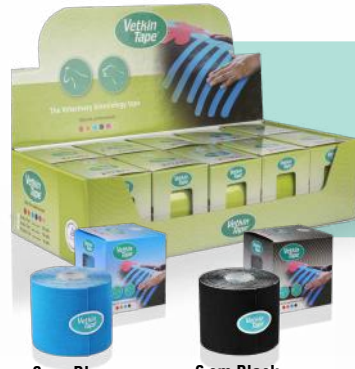
6 cm Blue 8717624161865